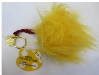
Pom-pom key ring £3-50