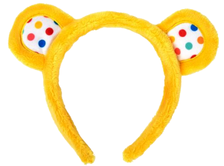
Pudsey Ears £2-50