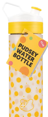
Pudsey Water Bottle £3-50