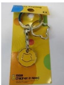
Pudsey key ring with trolley coin £2-00