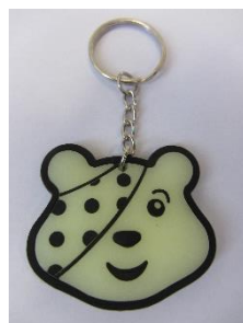
Glow in the Dark key ring £2-00